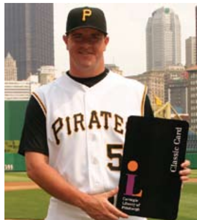
Pittsburgh Pirates Pitcher Matt Capps with his CLP Library Card.

51 Libraries in Allegheny County teamed up with CLP and the Pittsburgh Pirates for the second season of Pirates Tales . Pirates Pitcher Matt Capps recognized the Library for encouraging kids to set reading goals during the summer months during an on-field ceremony at PNC Park before the September 14 home game. More than 1,250 students participated in this year's program.