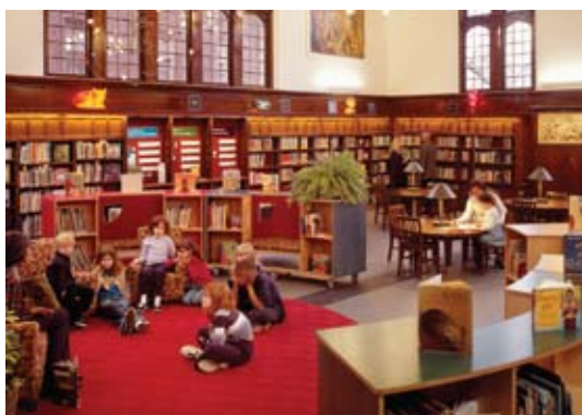
CLP – Homewood, renovated 2003